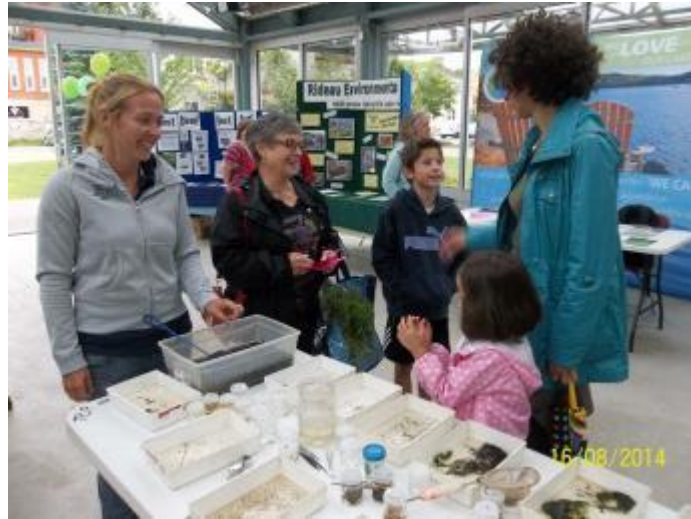
Discussing RVCA's Critters

Watershed Discovery Day, held this year on August 16 at the Farmer's Market in Perth, is our annual effort to increase public awareness of our watershed and showcase the many projects underway in