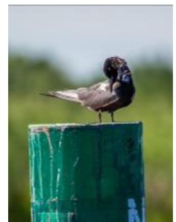
Black Tern preening on a buoy in the Tay Marsh

the Ottawa is the eventual destination for anything found in the Tay River.