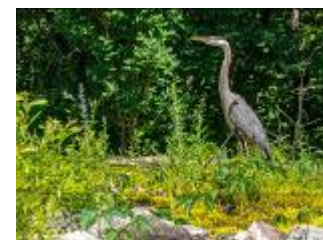
A Tay Great Blue Heron looks on

ties. One of the themes this year - lake planning - was of particular interest, given FoTW's early work in launching this in the Tay watershed.