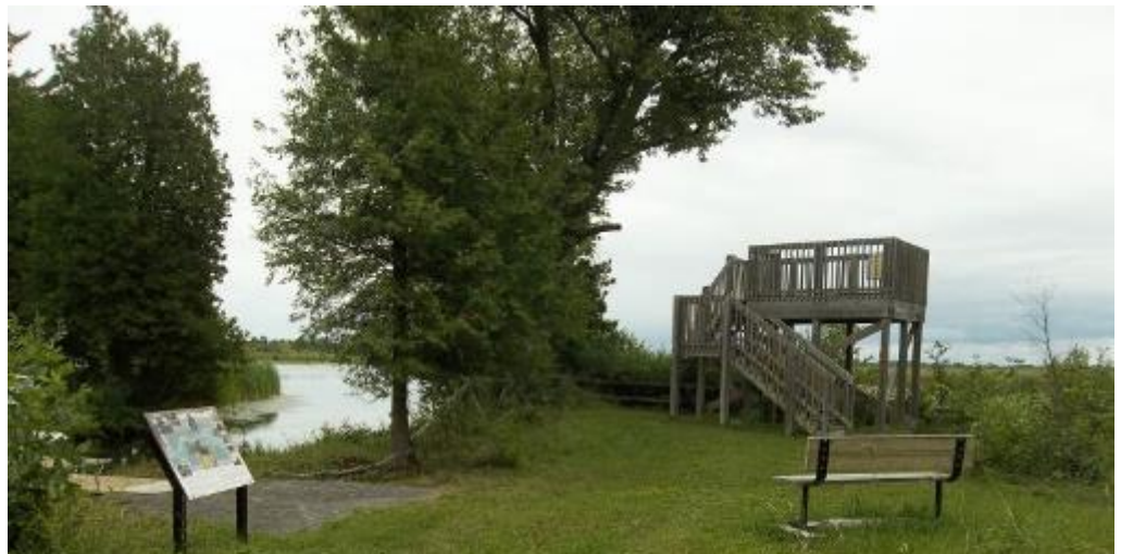
Paddlers on the Tay Canal will be happy to see that the observation site at the Perth Wildlife Reserve has been given a new life, with the installation of a dock and picnic area, thanks to Rideau Valley Conservation Authority. This interesting and beautiful site, the location of Lock Five of the original Tay Canal, is a most inviting day trip destination, by water or trail.

New dock at Lock 5 is an inviting day trip for boaters