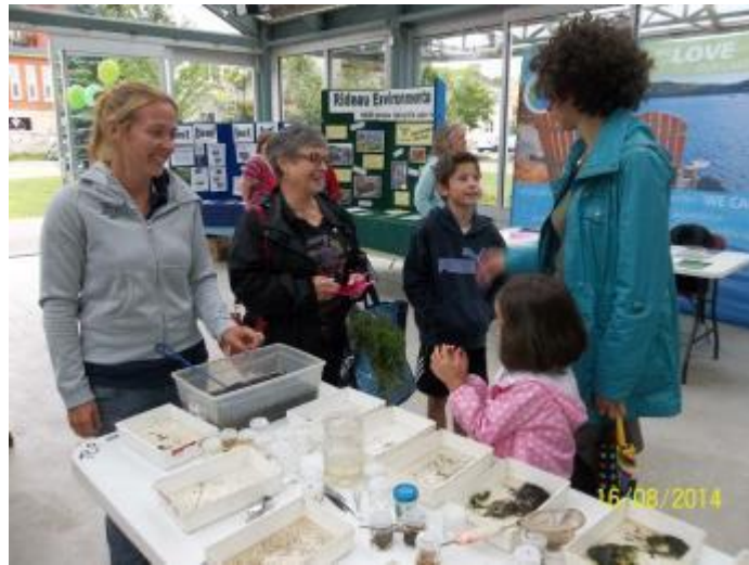
Discussing RVCA's Critters

Watershed Discovery Day, held this year on August 16 at the Farmer's Market in Perth, is our annual effort to increase public awareness of our watershed and showcase the many projects underway in