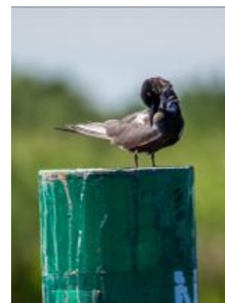
Black Tern preening on a buoy in the Tay Marsh

the Ottawa is the eventual destination for anything found in the Tay River.