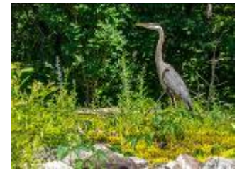
A Tay Great Blue Heron looks on

ties. One of the themes this year - lake planning - was of particular interest, given FoTW's early work in launching this in the Tay watershed.