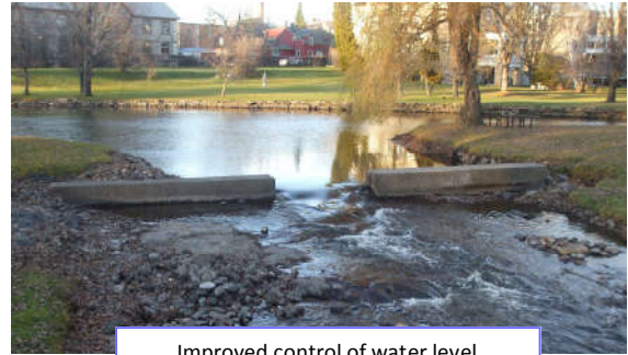
Improved control of water level

Of course, the main purpose of this project is to more closely manage flows and water levels in the Little Tay through Stewart and Code Parks. The situation is now much improved.