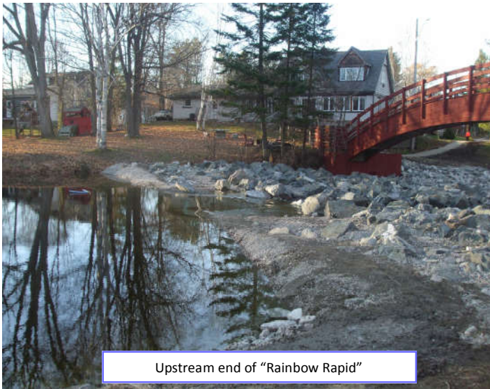
Upstream end of "Rainbow Rapid"

The Town of Perth is now the home of a beautiful new water feature. A "rocky ramp" has been built at the head of the Little Tay to replace the badly deteriorated control dam under the Rainbow Bridge. Rather than having the water drop as a broad curtain over the lip of the old dam, the rocky ramp confines the flow to a narrower V shape channel. The slope and depth of this channel is designed to allow fish migration upstream by eliminating the vertical height of the dam.