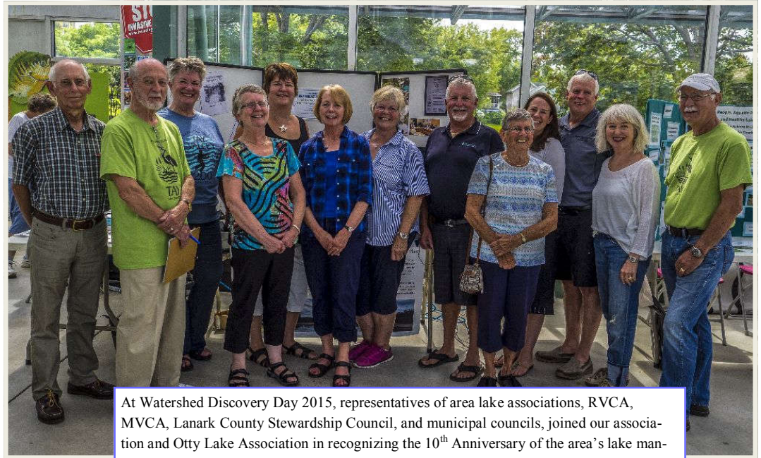
At Watershed Discovery Day 2015, representatives of area lake associations, RVCA, MVCA, Lanark County Stewardship Council, and municipal councils, joined our association and Otty Lake Association in recognizing the 10 th Anniversary of the area's lake management planning program.