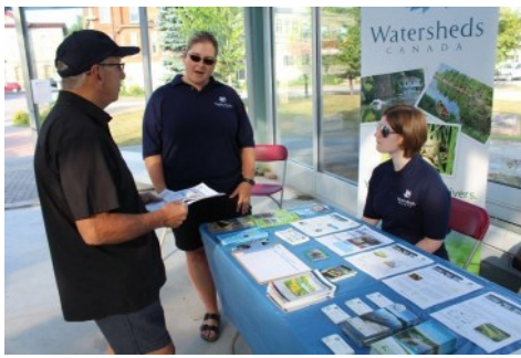
Watersheds Canada Information

On 6 August, another successful Watershed Discovery Day took place at Perth’s Crystal Palace. This was the 16th year for this event and the 5th year in association with the Perth Farmers’ Market. According to comments from participants and attendees, the event was successful, in terms of both interest shown and attendance.