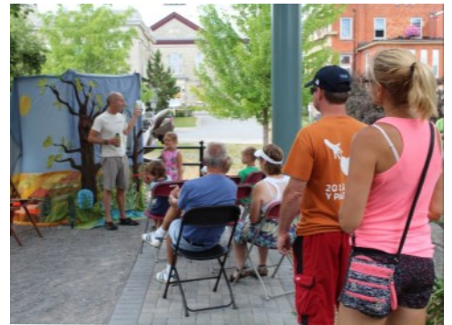
Entertainment by the Paddling Puppeteer

Support for the event was provided by the TD Friends of the Environment Foundation, Perth Farmers’ Market, Lake 88 Radio Station and the area Source Water Protection Program.