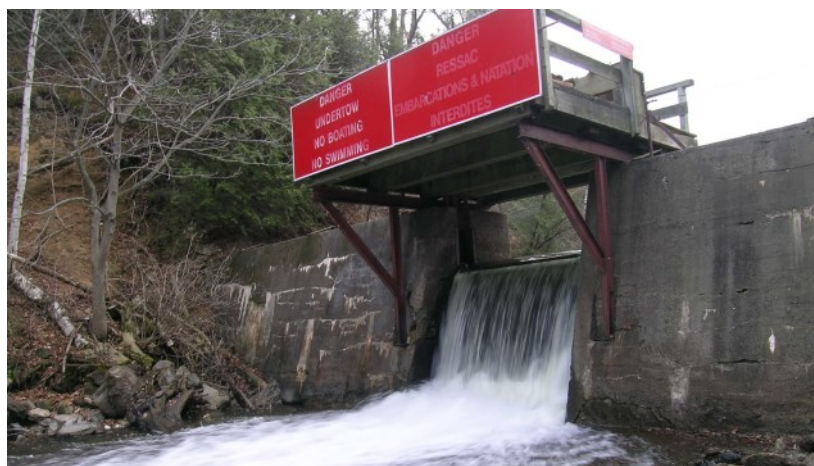
Bolingbroke Dam up for Replacement

Meanwhile, on the Tay River at Bolingbroke, design work is underway for the completely new dam at Bobs Lake, which will be built 40 metres upstream from the present location. Construction is expected to begin next summer, after July. Community engagement presentations are planned for the Spring and Summer of 2017. Details on this project may be seen at: http://www.pc.gc.ca/eng/lhn-nhs/on/rideau/visit/infrastructure/tay/barrage-lac-bobs-lake-dam.aspx