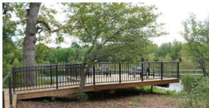
Viewing Deck by the Tay

The FoTW have launched a drive to raise funds for a new interpretive panel as a contribution to the recently extended Tay River Pathway. This 1.5 km (return) trail is a wheelchair accessible loop that begins behind Lanark Lodge and the Perth Community Care Centre and meanders past the Round Garden for the Blind.