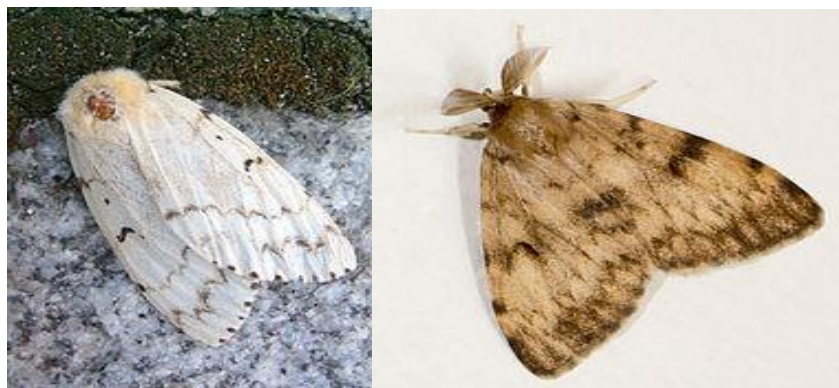
Female and Male Gypsy Moths

Suggestion: If you are planning to implement any of the measures outlined above, be sure to buy your supplies early to avoid disappointment.