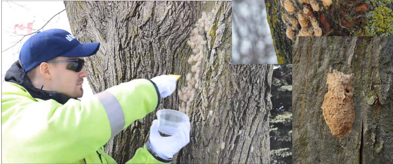
Scraping egg masses; assemblage of egg masses; single Egg mass

During this time period, the gypsy moth is in the egg stage and masses can be found on tree trunks, branches, buildings, rocks, and even your car. Egg masses are often found at the base of a tree, but also can be found all the way up a tree trunk, especially for badly affected trees. One egg mass contains about 300 eggs.